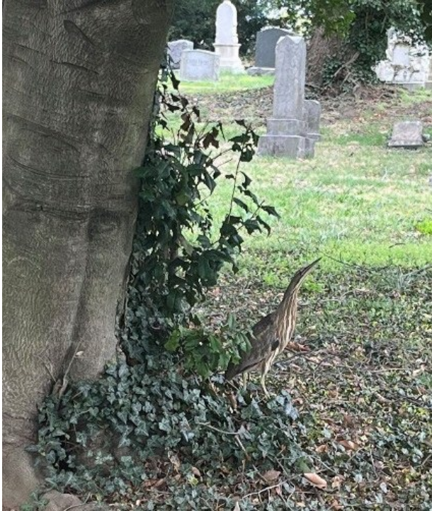
American Bittern (Heron)

During Superintendent Joe Connel's work in the cemetery, he often comes upon local wildlife, such as deer, raccoons, squirrels, snakes, etc. The pictures below depict some of the more unusual species.