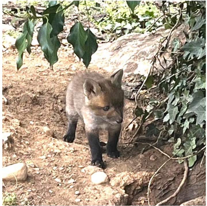
Gray Fox Cub