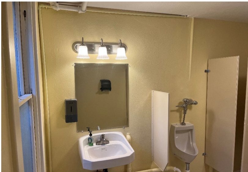
Men's Room Vanity & Urinal