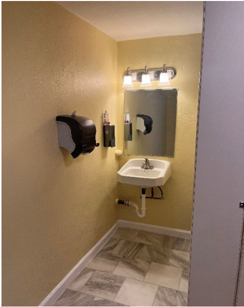
Ladies Room Vanity