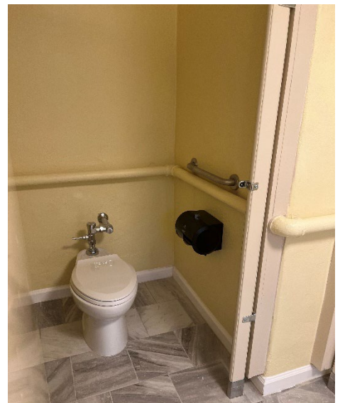
Mens Room Stall

The Newsletter is produced by the Board of Trustees of Prospect Hill Cemetery, 2201 North Capitol St., NE, Washington, DC 20002