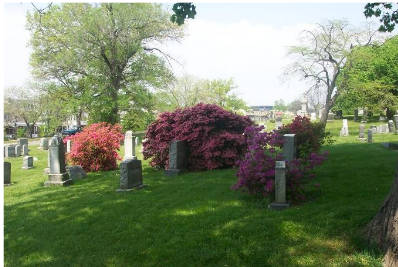
Looking forward to Spring